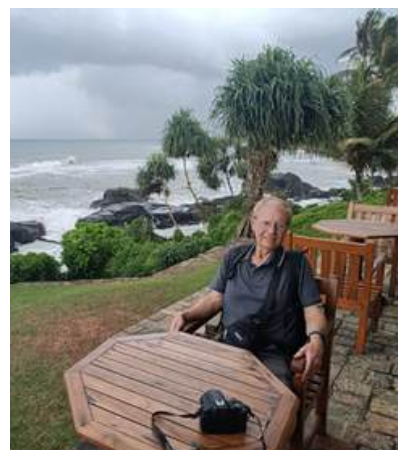
In Sri Lanka