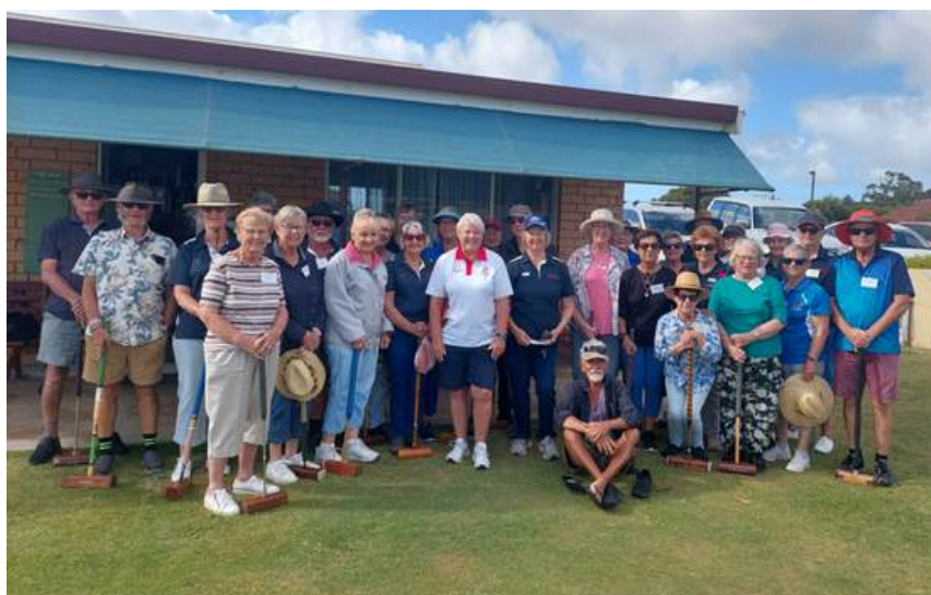
Port Lincoln CC