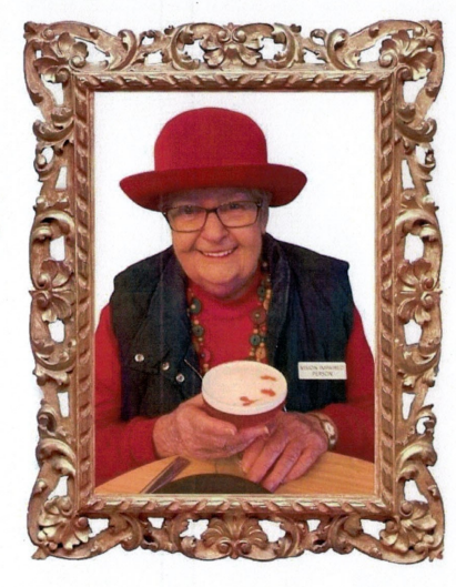
"Thank you for being part of my life"