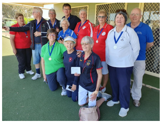
Winners are grinners

Congratulations Port Pirie Club on reaching your Centenary and giving all who attended a weekend to remember.