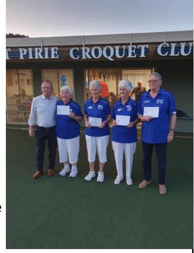
New Life Members

Port Pirie Club celebrated its milestone 100<sup>th</sup> birthday on the Labour Day long weekend 2023. A two day competition was planned involving both Association and Golf players. Thirty players from all over SA ventured to Port Pirie to participate. Along with the Club's two artificial lawns the club arranged for the Council to set up two lawns on the oval behind the clubrooms. The lawns on the oval proved 'challenging' for the players as did the unseasonably hot weather on Saturday. The last round of GC games on Saturday were postponed until early Sunday morning, when the cold change had moved in and the players needed their winter woollies again. Players also had to contend with losing an hour's sleep with Daylight Savings starting overnight Saturday.