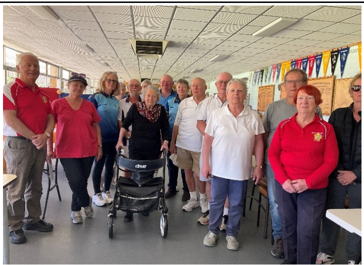
Those present at the end of the Swiss Singles, Thursday afternoon, 16/11/23

This tournament was conducted on 11-12 November. Eight men and six women participated, some of the very best AC players in South Australia, including six from country clubs.