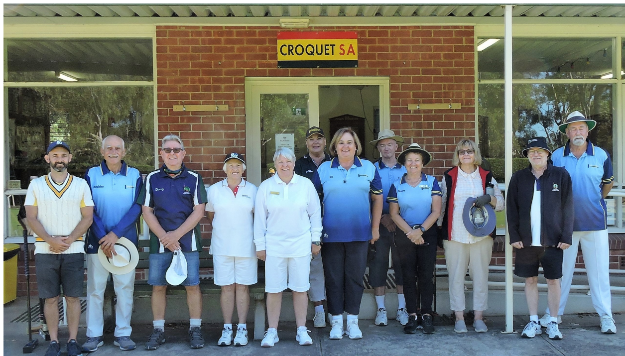
Twelve participants of the Director's Cup L=> R

These players represented the following clubs - Millswood, Brighton, North Adelaide, Hyde Park and Norwood Croquet Clubs.