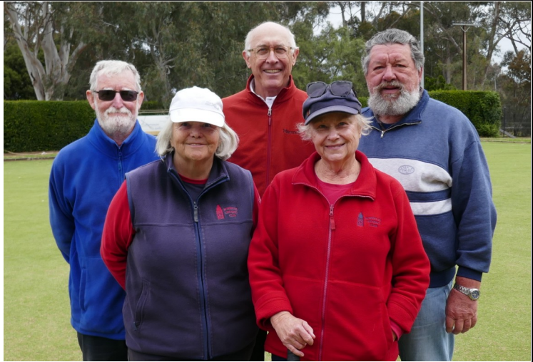
The five players involved in this year's Div 3 Singles.

Court 1 was least effected with flooding in corner 4, so after most of the water was cleared, double banked play started using one lawn.