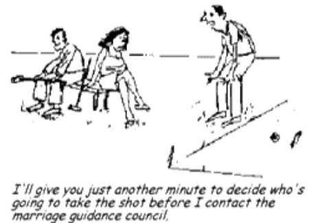
I'll give you just another minute to decide who's going to take the shot before I contact the marriage guidance council.