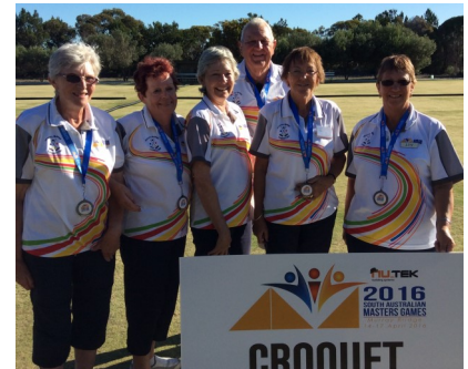
Murray Bridge Masters Games entrants

A very successful event with 28 players. When the Council was approached to include croquet they suggested that we would not get many players—however we were first with entries and first to be full.