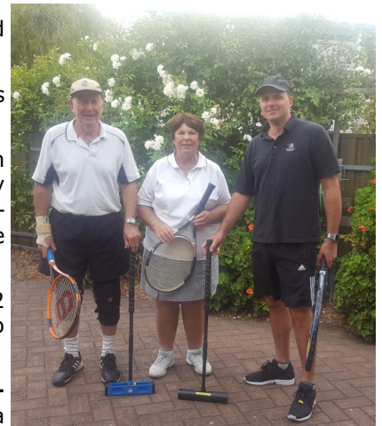
Members of Brighton Tennis Club enjoyed Hammer Time

Over the 3 Hammer Time evenings we have introduced 60 + new people to croquet at Brighton. They all have gone home having thoroughly enjoying themselves with a leaflet “What the Brighton Croquet Club Offers You” outlining play available on Tues & Thurs. (Club mornings 9.30a.m-12.15p.m.), Tues. evenings 7p.m.-9.00p.m. Wed. (coaching 9.00a.m.-11.00a.m.) Friday Evening B.B.Q. (twice a month) 4.00p.m. onwards and week-ends. At this stage with Club support we are planning to hold further Hammer Time events from Oct 2019 - April 2020.