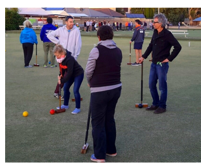
Fun at Hammer Time Holdfast Bay