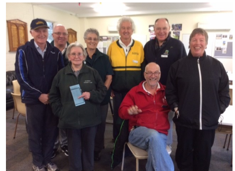
Sunday singles group