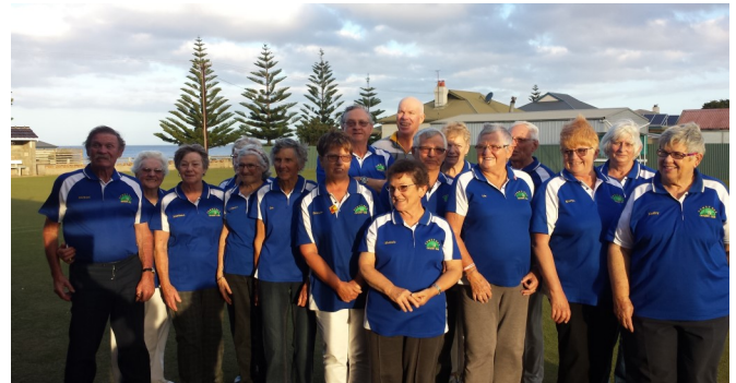
Tumbly Bay club members